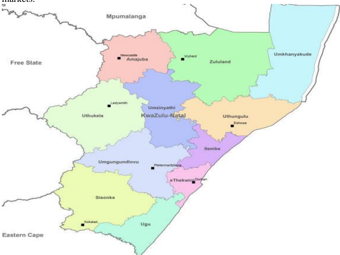
Figure 1: Map of KwaZulu-Natal district municipalities (DAFF, n.d)

were supplying a combination of formal and informal markets, wholesale and fresh produce markets.